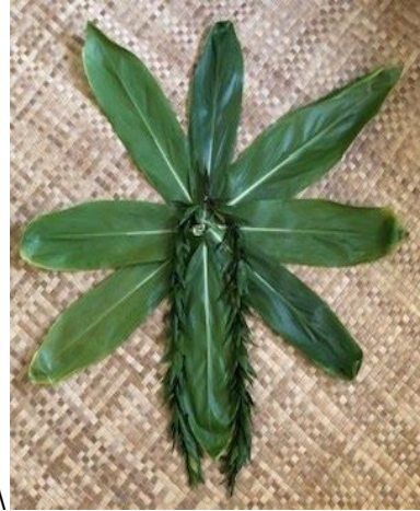
Lei lāʻī maile

We make three different lei lāʻī filled with aloha to honor all our ancestors, our native relatives, and our Mother Earth.