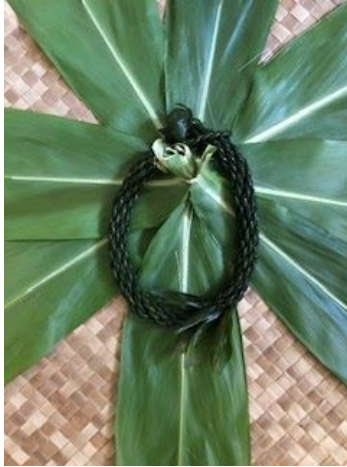
7 strand lei lāʻī rope