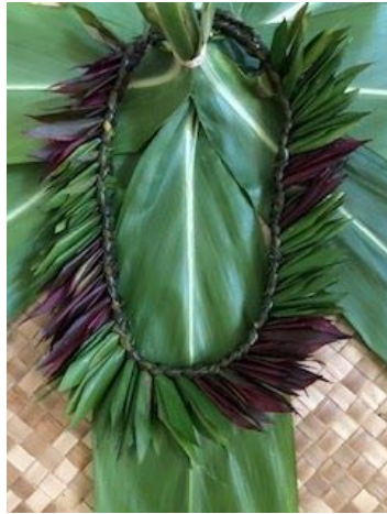
Red/green lei lāʻī